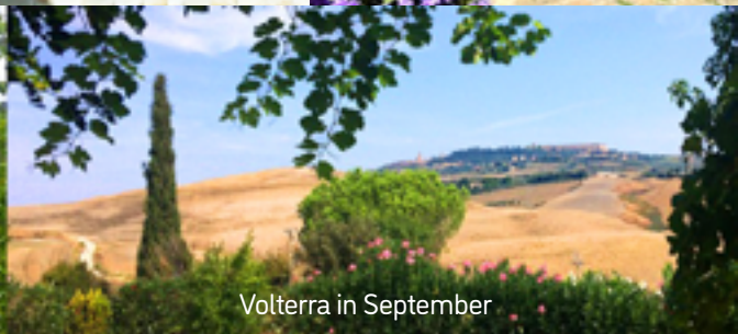
Volterra in September

Save the dates today! 10-17 September 2023