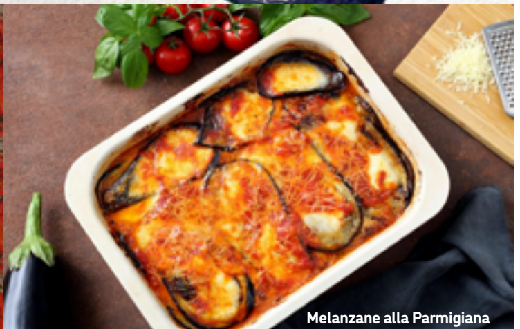
Melanzane alla Parmigiana