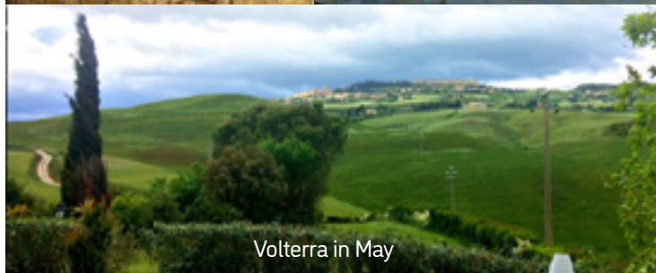
Volterra in May