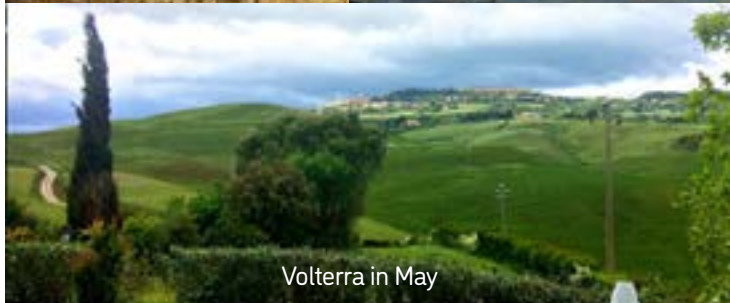
Volterra in May