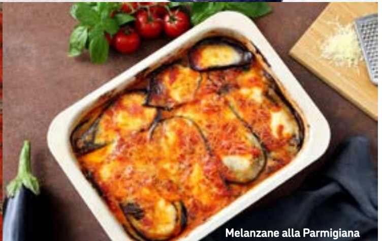
Melanzane alla Parmigiana