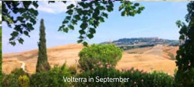
Volterra in September

Save the dates today! 21-28 May 10-17 September